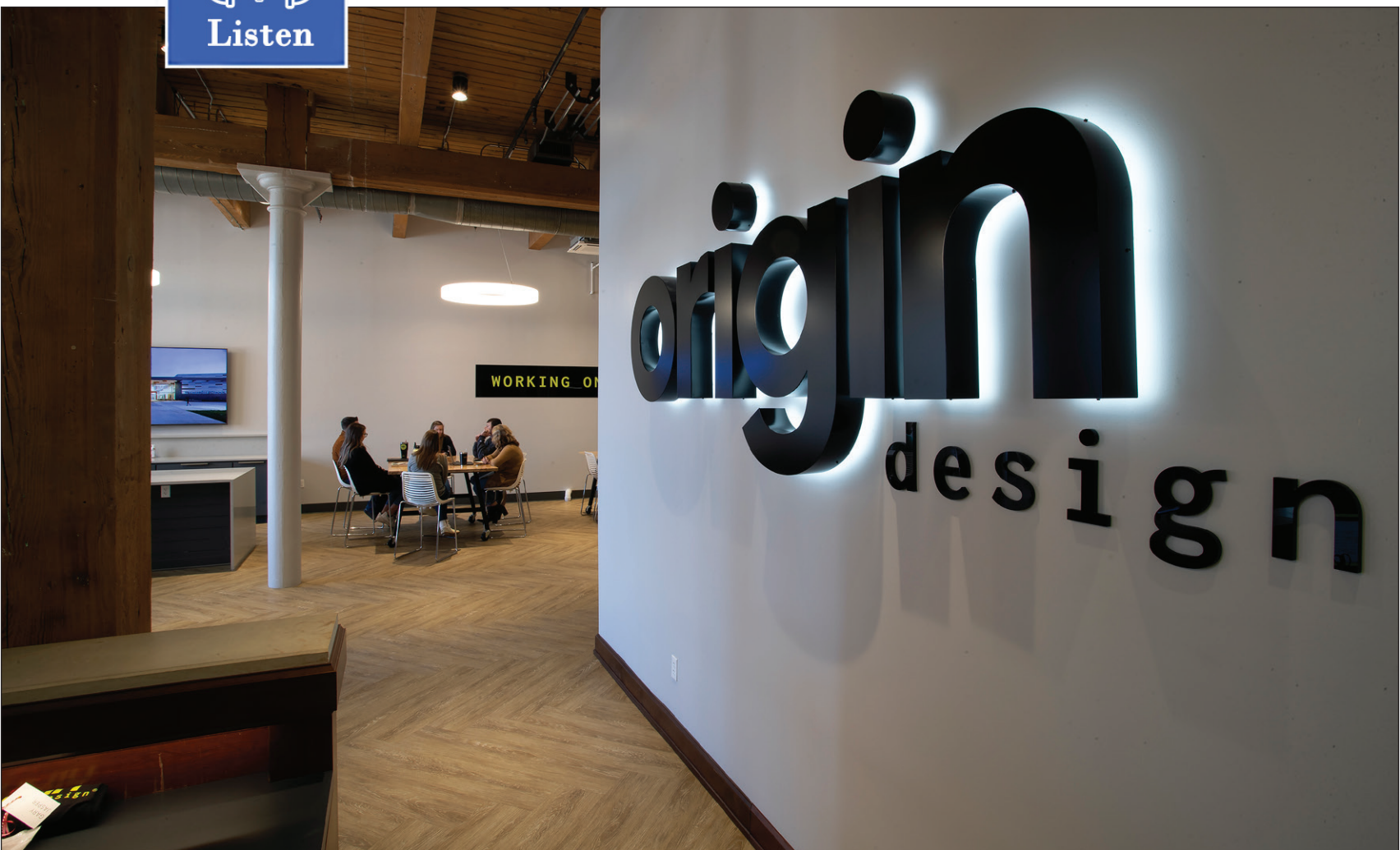
Origin Design on Main Street in Dubuque.