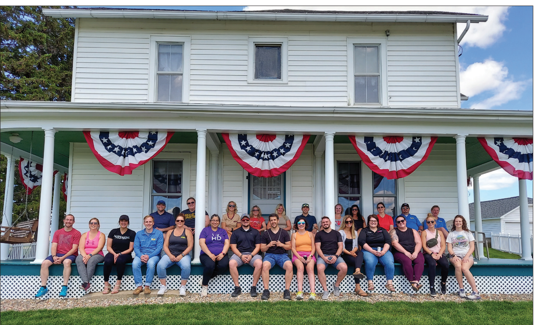
Leadership Dubuque class of 2024 held their final day with a celebration wrap up at Field of Dreams.