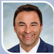
Mayor Brad Cavanagh CITY OF DUBUQUE Ex-Officio City of Dubuque