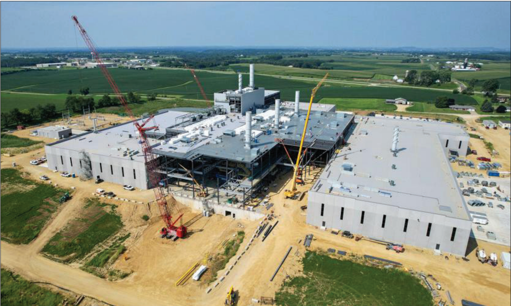
Tri-City Group is playing a key role in the construction of A.Y. McDonald’s new brass foundry, near Dickeyville, Wis.

“It’s something we’re very proud of,” he said. “We want to make sure everybody goes home at night.”