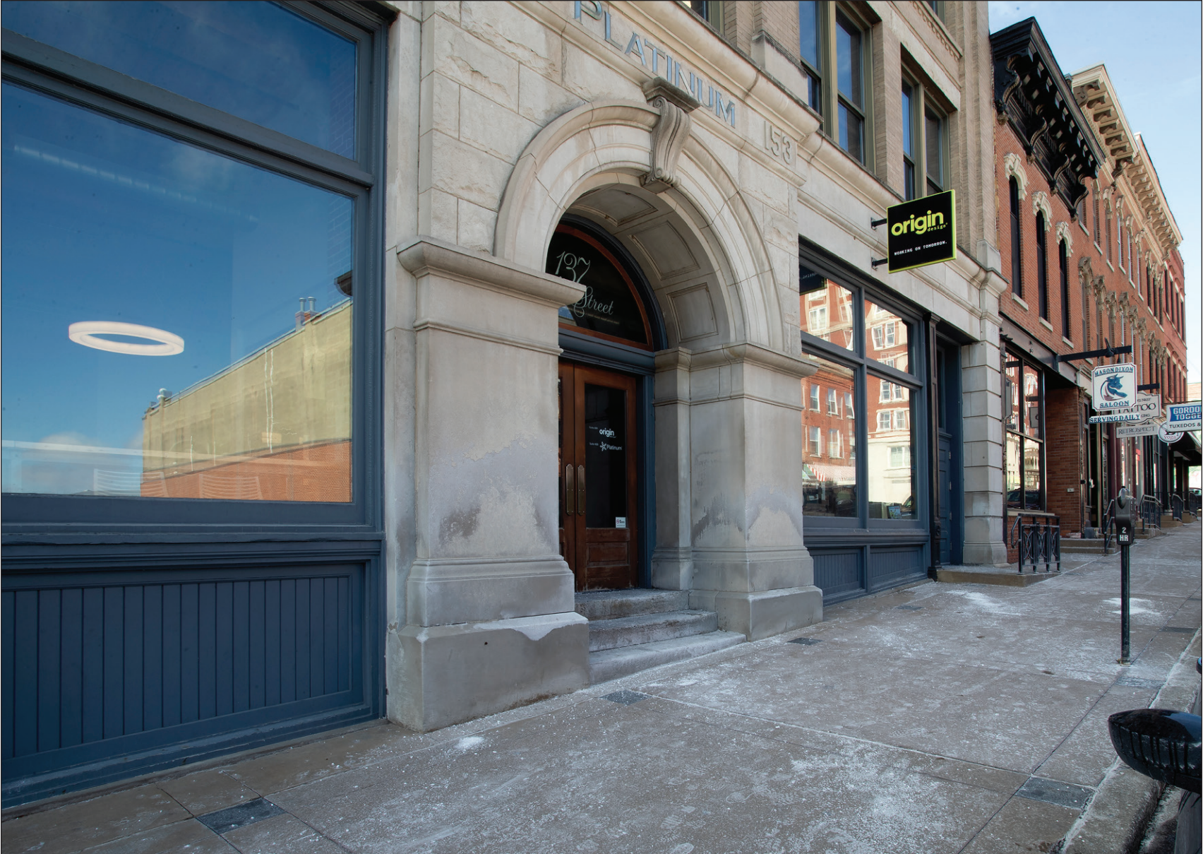
Exterior of Origin Design on Main Street in Dubuque.