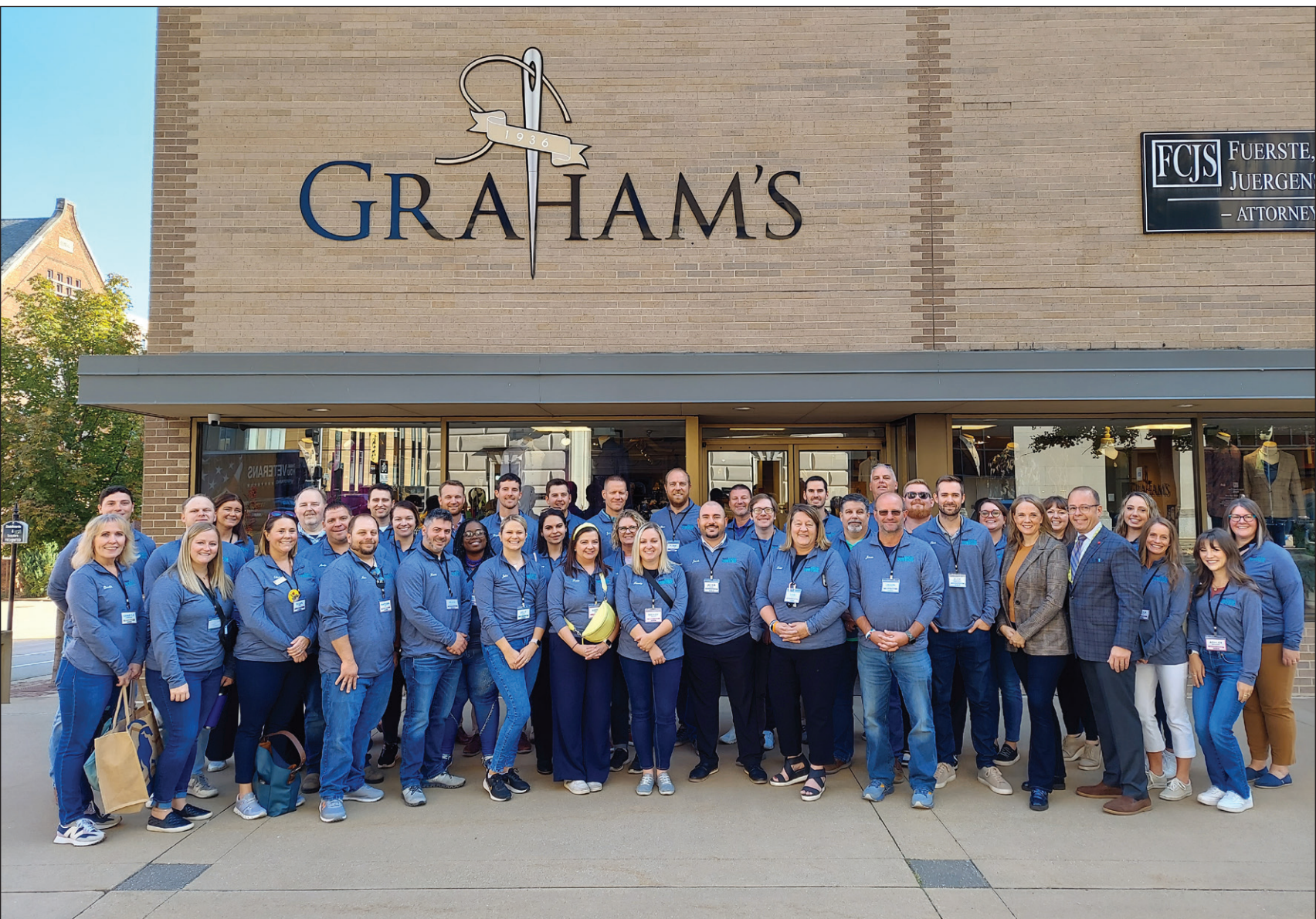
Graham's Style Store hosted Leadership Dubuque for Arts & Media Day to talk about the art of fashion and professional dress.

The success of Leadership Dubuque has inspired the Leadership Dubuque Alumni Network — a new program designed for graduates who want to stay engaged with